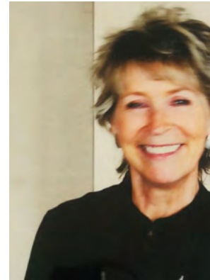
ADVISER ON INTERIOR DESIGNERS

Our world renowned advisory board ensures that the property-related specialists we work with are the best of the best. The Advisors act as the gatekeepers to our stable of talent. RedBook's reputation is built on our uncompromising demand for trust, integrity and delivery.