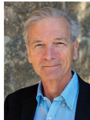
ADVISER ON TRADITIONAL ARCHITECTS & PLACE MAKING